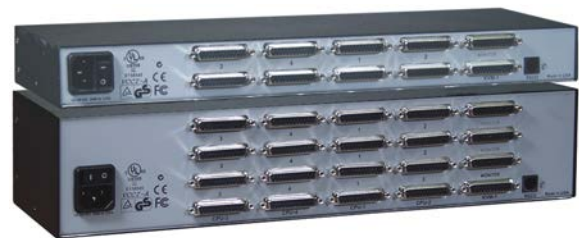
Rear View - MPB-4U2V (top) / MPC-4U4V (bottom)

■ Phone: 281-933-7673 ■ E-mail: sales@rose.com ■